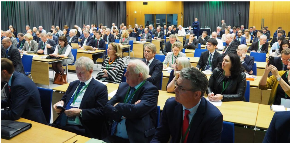
About 250 reps of the dairy sector from 36 countries made up the audience of the 2018 EDA Dairy Platform in Dublin